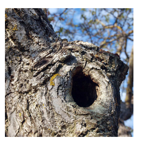
hollow in a tree